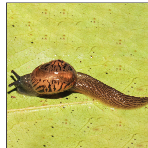
Cryptosemelus tigrinus Pholyotha, sp. nov.