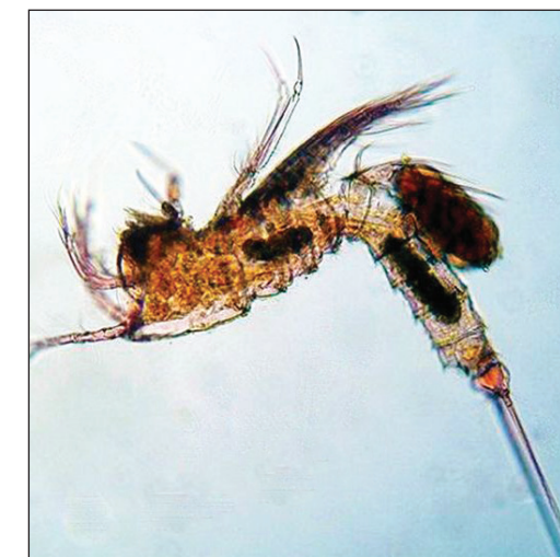
Esola wellsi Fuentes-Reinés et al. sp. nov.