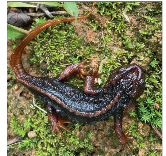
Tylototriton umphangensis Pomchote et al., sp. nov.