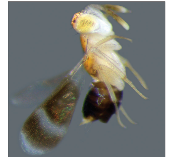
Eutrichosomella yunnanensis Chen & Chen sp. nov.