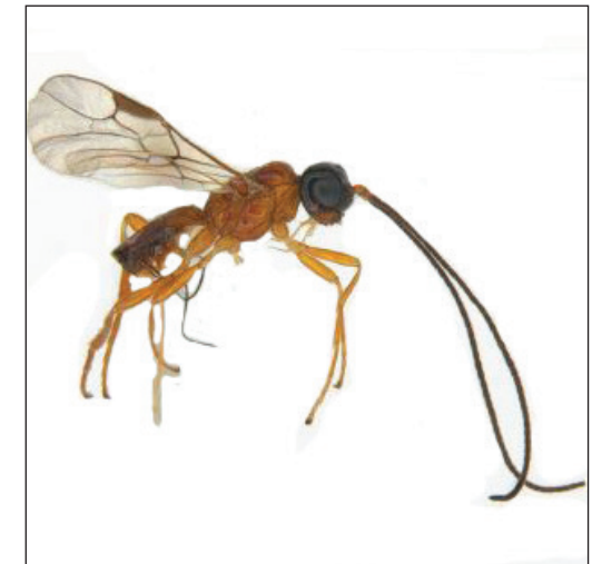
Hylcalosia bicolor Sohn & van Achterberg, sp. nov.