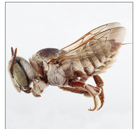
Chalicodoma (Pseudomegachile) riyadbense sp. n.

ZooKeys Launched to accelerate biodiversity research