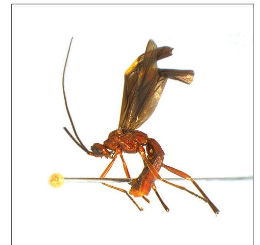
Aleiodes vassununga Shimbori & Pentead-Dias, sp. n.