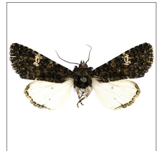
Polymixis ivanchiki Pekarsky, sp. n.