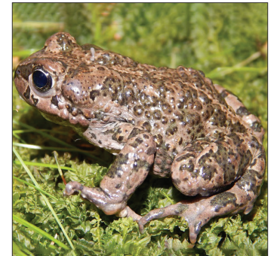
Bufo baturae Stöck et al., 1999