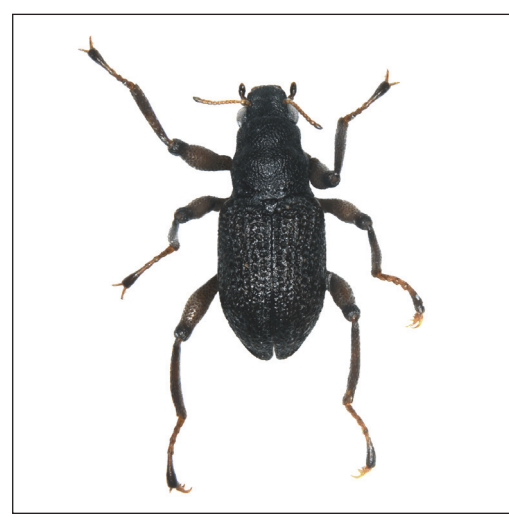
Ancyronyx montanus Freitag & Balke, sp. n.