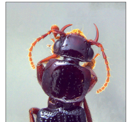
Neolindus irmleri Asenjo sp. n.