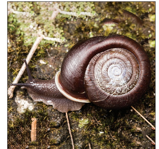
Pseudostegadera qiului Chen, sp. nov.