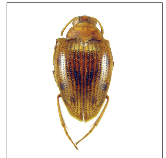
Halipus (Halipus) latreillei Jia & van Vondel, sp. n.