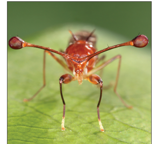
Madagopsina parvapollina Feijen, Feijen & Feijen, 2018