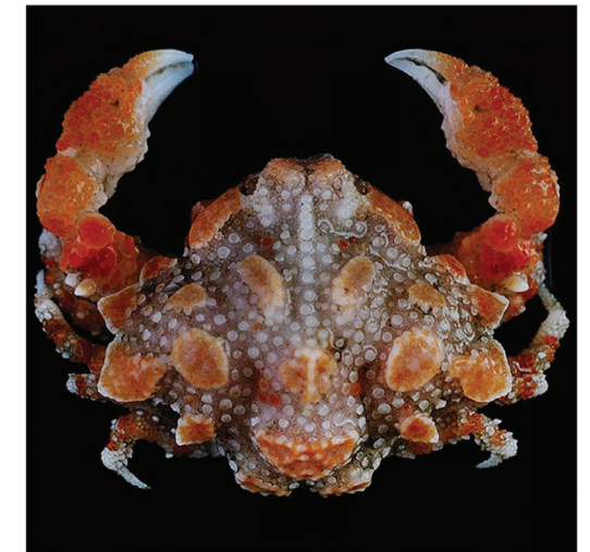
Orientotlos iishibai Sakai, 1980