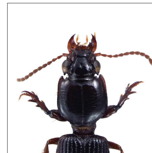
Semiclivina (Uroclivina) bergeri Dostal, sp. n.