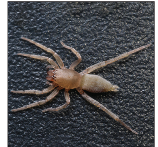
Femorbiona shenzhen Yu & Li, sp. nov.