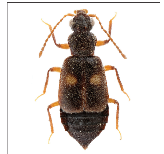
Lesteva (s. str.) erythra Ma & Li, sp. n.