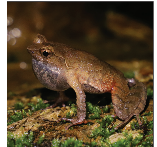
Panophrys congjiangensis Luo et al., sp. nov.