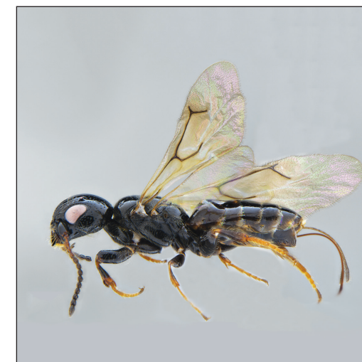
Carminator daliensis Chen & Liuhe, sp. nov.