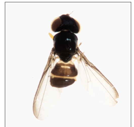
Thressa longimaculata sp. n.

ZooKeys Launched to accelerate biodiversity research