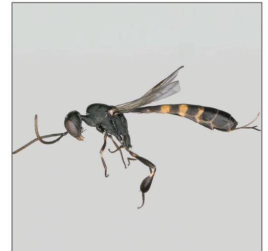
Gasteruption brevicuspis Kieffer, 1911