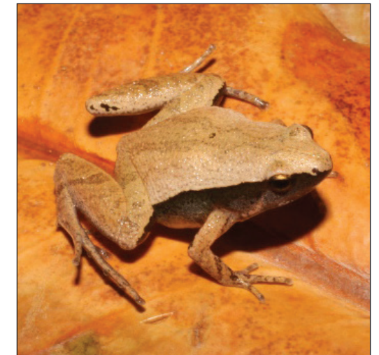
Microhyla ninhthuanensis Hoang et al., sp. nov.