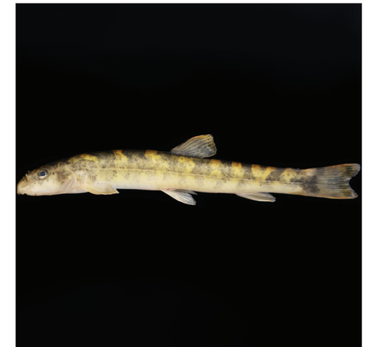
Triplophysa wulongensis Chen et al., sp. nov.