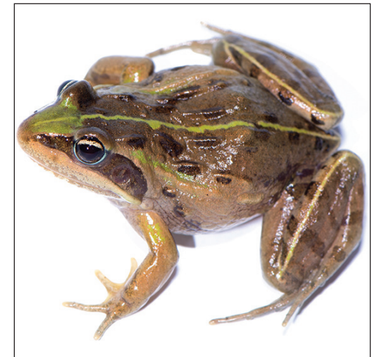
Ptychadena robeensis Goutte et al., sp. nov.