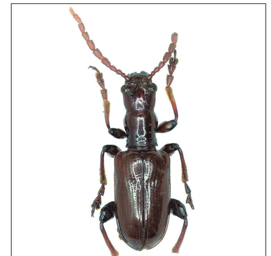
Manipuria yuae Xu et al., sp. nov.