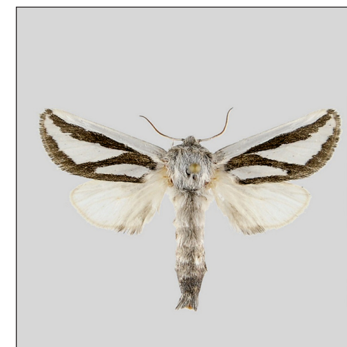
Mormogystia brandstetteri sp. n.