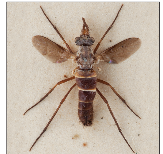
Salwaea burgensis Winterton, Hauser & Badrawy, sp. n.

ZooKeys Launched to accelerate biodiversity research