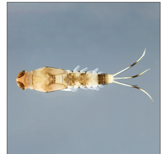
Labiobaetis freitagii Kaltenbach et al., sp. nov.