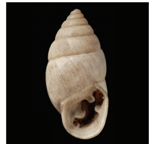
Plagiodontes patagonica (d'Orbigny, 1835)