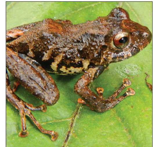
Pristimantis sinschi Lehr, Moravec & Kodejš, sp. nov.