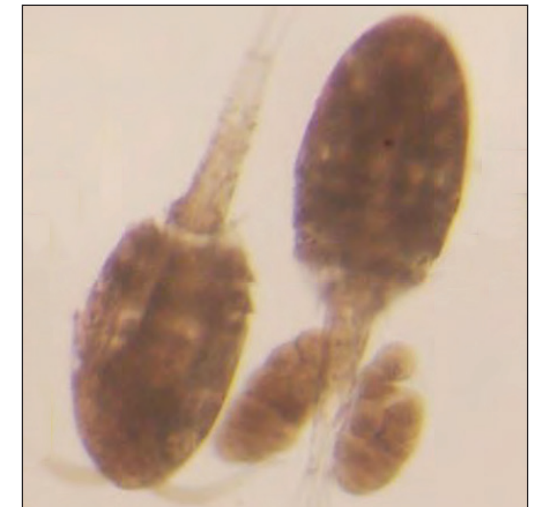
Cyclopina busanensis Karanovic, sp. nov.