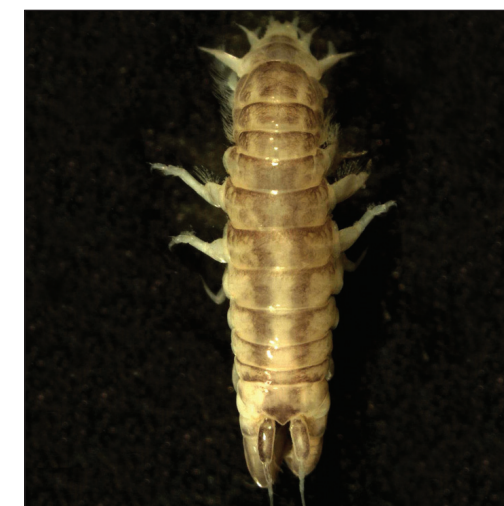
Sinocorophium hangangense Kim, sp. n.