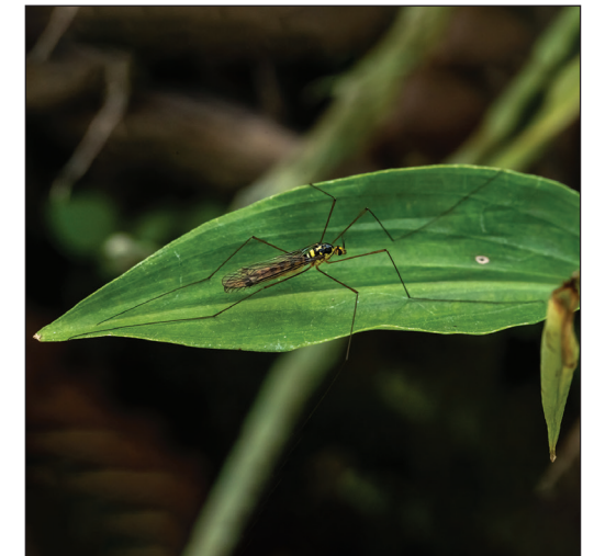
Nephrotoma beibengensis Yang et al., sp. nov.