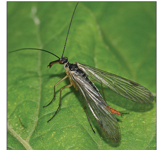
Cerapanorpa minshana Gao et al., sp. nov.