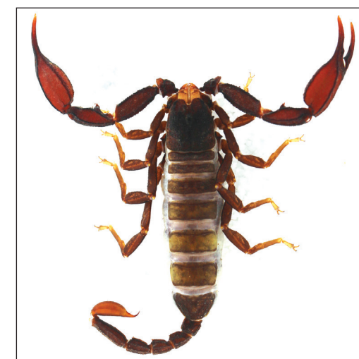
Euscorpiops lii Di & Qiao, sp. nov.

ZooKeys Launched to accelerate biodiversity research