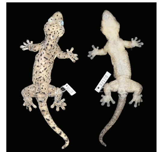
Thecadactylus oskrobapreinorum Köhler & Vesely sp. n.