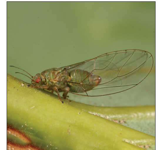
Trioza turouguei Gene-Sheng et al., sp. nov.

ZooKeys Launched to accelerate biodiversity research