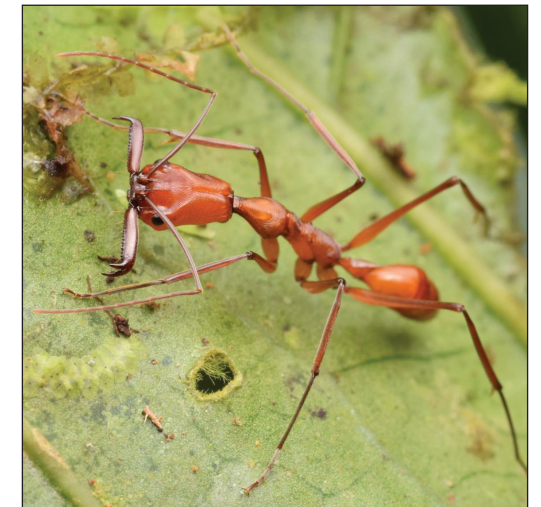
Odontomachus davidsoni Hoenle, Lattke & Donoso, sp. nov.