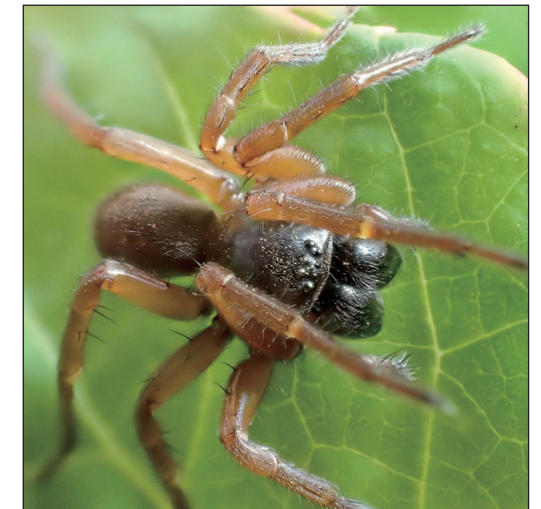
Tonsilla subyanlingensis K. Liu & X. Xu, sp. nov.