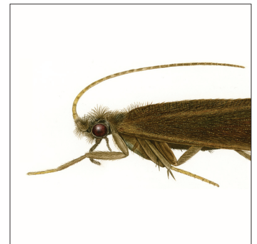
Itauara julia Robertson & Holzenthal, sp. n.

ZooKeys Launched to accelerate biodiversity research