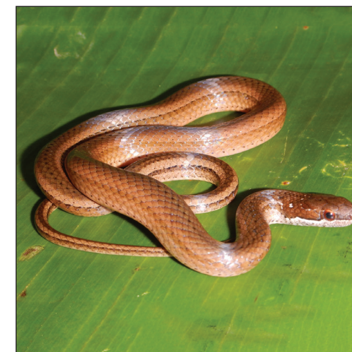
Coniophanes fissidens (Günther, 1858)