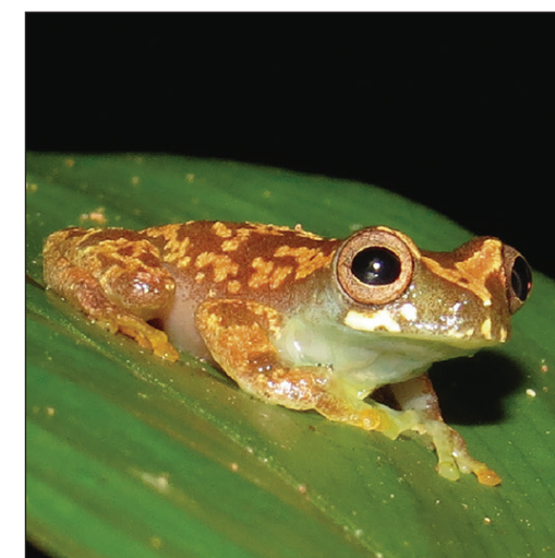
Dendropsophus bilobatus Ferrão et al., sp. nov.