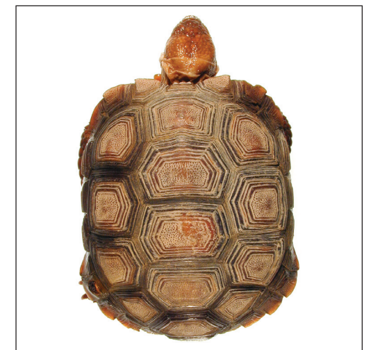
Gopherus morafkai , sp. n.