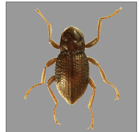
Podonychus gyobu Yoshitomi & Hayashi, 2020, sp. nov.