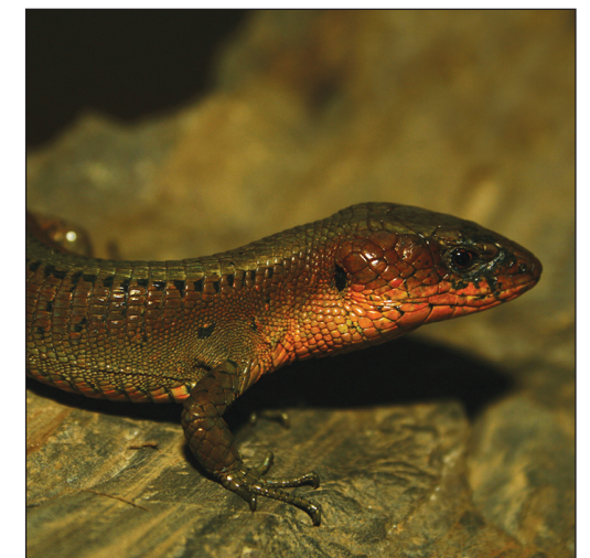
Euspondylus chasqui , sp. n.