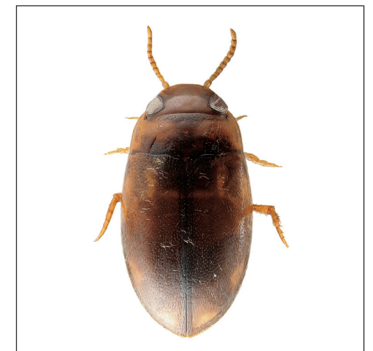
Neobidessodes darwiniensis Hendrich & Balke, sp. n.