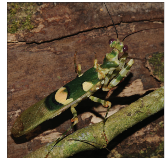
Chlidonoptera roxanae Moulin, sp. nov.