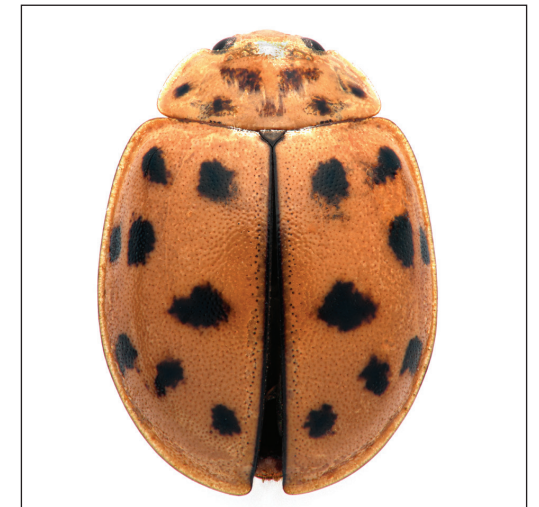
Oenopia shirkuhensis Zare Khormizi & Nedvěd, sp. nov.