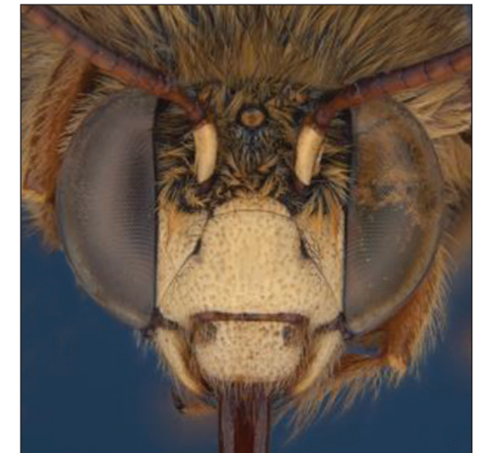
Amegilla (Asaropoda) albiclypeata Leijs, sp. nov.